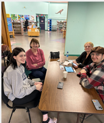
TECH TEA WITH TEENS