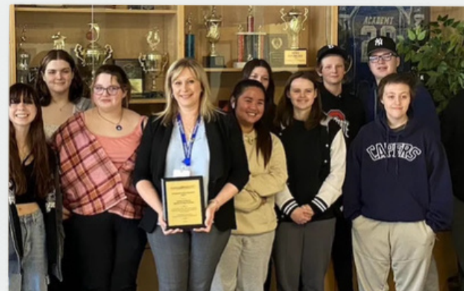
SAO2 RECEIVED AN AWARD FROM MACGILLIVRAY GUEST HOME FOR VOLUNTEERING WITH SENIORS