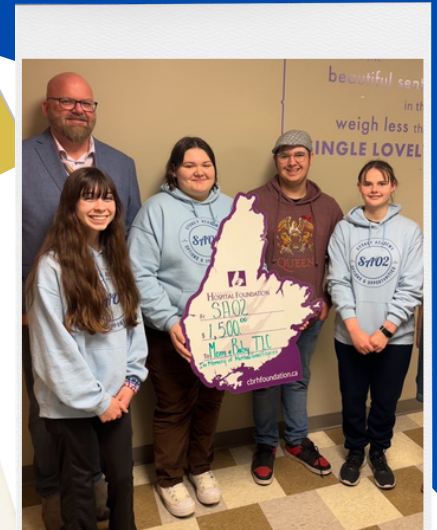
$1500 RAISED FOR THE TLC FUND AT THE CBRH