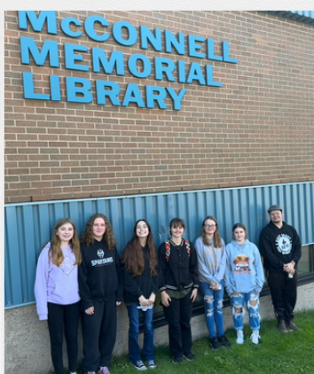
TECH TEA WITH TEENS