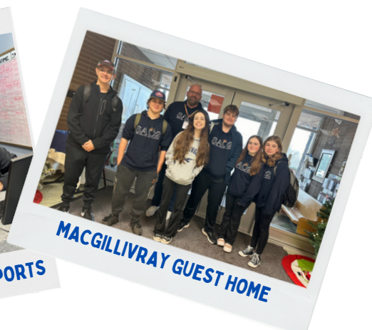
MACGILLIVRAY GUEST HOME