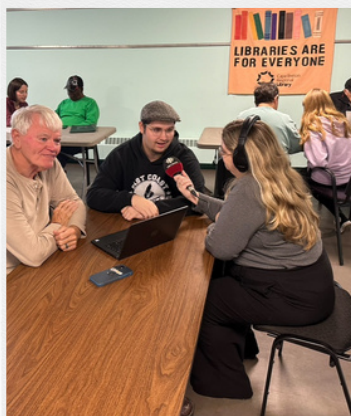
CBC INFORMATION MORNING INTERVIEW