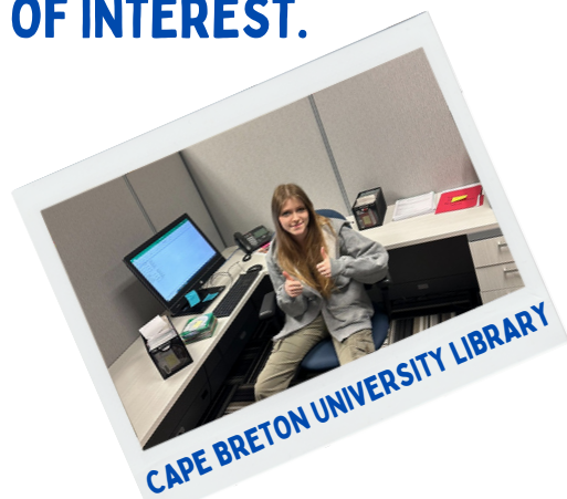
CAPE BRETON UNIVERSITY LIBRARY