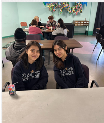
TECH TEA WITH TEENS